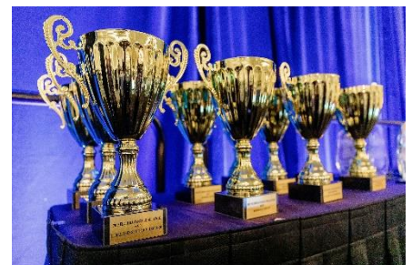
Trophies presented to winners of the 2018-2019 Florida FAFSA Challenge.

Click here to download FCAN's Florida FAFSA Challenge toolkit for ideas on driving FAFSA completion at your school