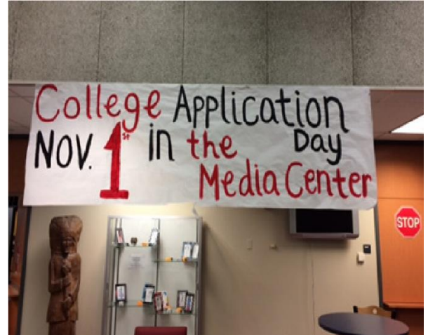
Promotional sign at East Bay High School

Click here to download FCAN's Apply Yourself Florida toolkit for more ideas for your event!