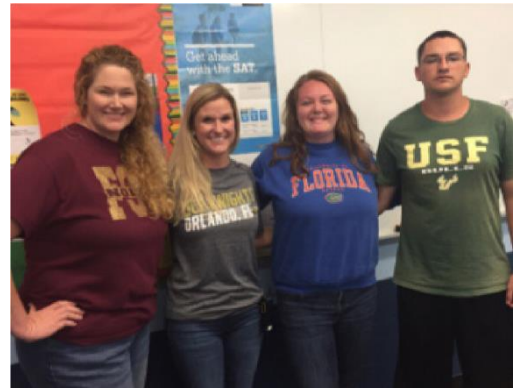
College T-Shirt Day at Wesley Chapel High School

Keep in mind that some lower-income or first-generation college students may not own college apparel. Giving away college apparel as prizes or incentives can be an effective way to engage these students. Alternatively, have students decorate a plain T-shirt with colleges of interest.