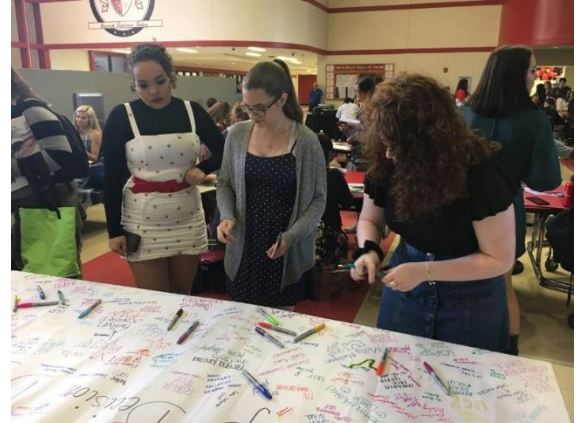
Students can sign a banner with their names and where they are going after high school. At Bloomingdale High School, students do this as part of College Decision Day.