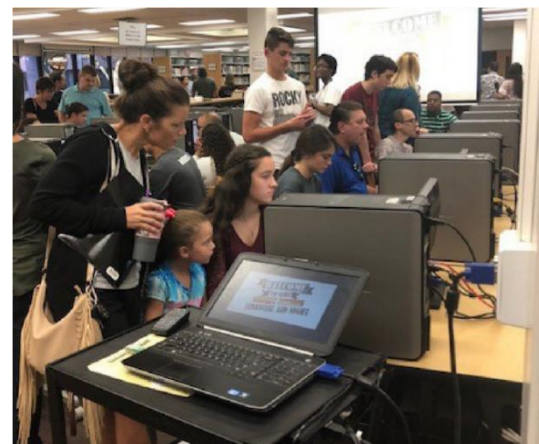
Encouraging parents to bring younger siblings to a college night can help build aspiration for higher education.

For parents of the younger students, it is important to introduce them to options for paying for college early, including Florida Prepaid, Bright Futures, and FAFSA. Familiarizing parents with these resources can increase their confidence that college is attainable for them and can help parents start planning early. This can increase the student's motivation to perform well.