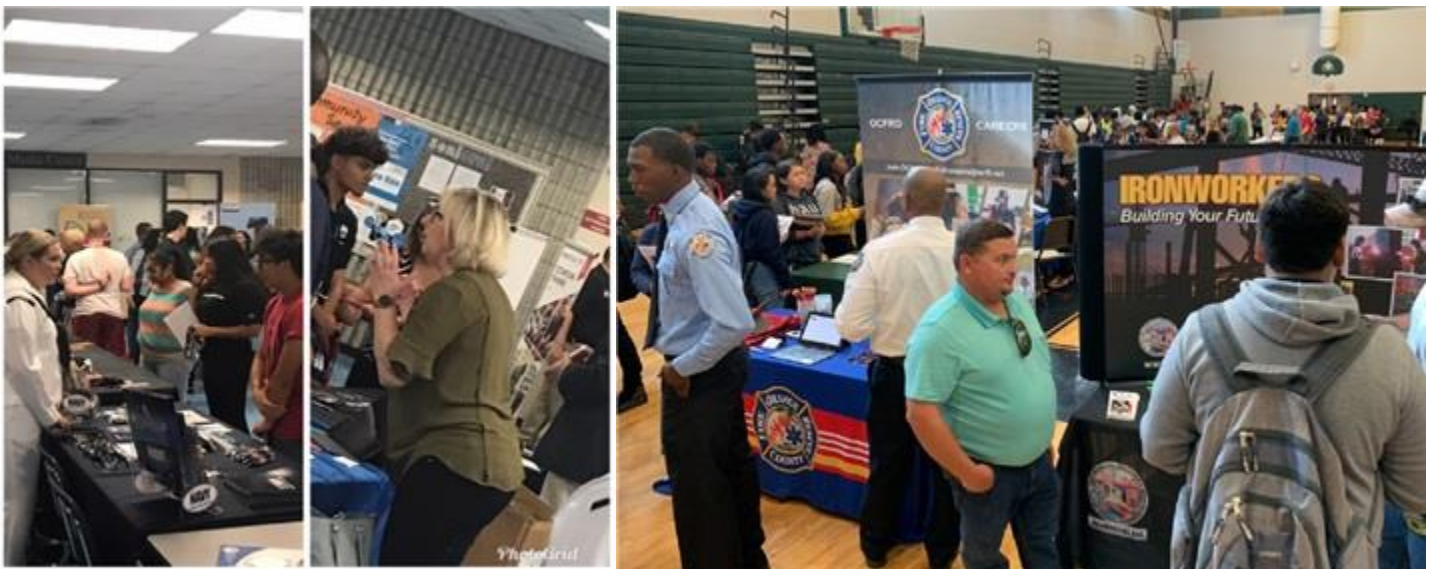
The college fair at SouthTech Academy in Boynton Beach featured representatives from local colleges and from the military.

A good strategy is to host a college/career fair primarily for eleventh and twelfth graders and invite a smaller selection of younger students to participate as observers. To engage younger students in the college fair, give them an activity to complete, like a scavenger hunt or a “passport” to have stamped at different booths, that encourages them to ask questions (see Sample Informal Interview Questions ). An alternative is to have a career fair for elementary and middle school students to learn about different careers. The “passport” activity can be applied during the career fair to encourage students to engage with careers in different career clusters.